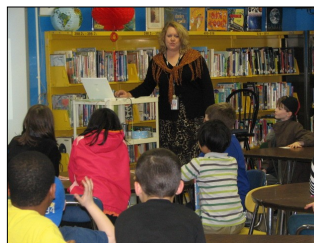
French Road Elementary School Library