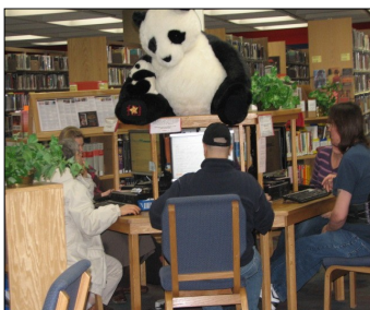
Henrietta Public Library

That's just one of the inspiring stories people wrote when asked "Do you love your library?" as part of the Rochester Regional Library Council's annual "Library of the Year" contest to celebrate National Library Week, April 10 -16. Hundreds of people