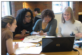
LeRoy V. Good Library

The LeRoy V. Good Library at Monroe Community College was chosen as "Academic Library of the Year". Judges noted that LVG at MCC is really appreciated by its large and diverse student population of more than 19,000 students.