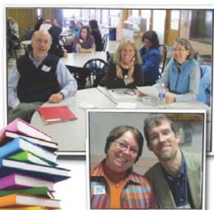
Speakers, Professional Development opportunities highlight Library Leadership Academy January 27

"What a pleasure it was to have so many librarians, library system directors, presenters and vendors come together here for Newark's third Library Leadership Academy. It is a day to be together for shared experiences, friendships and to learn what's new out there for the future of the profession," she said.