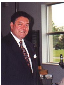
Senator James Alesi