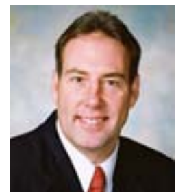
Senator Joseph Robach