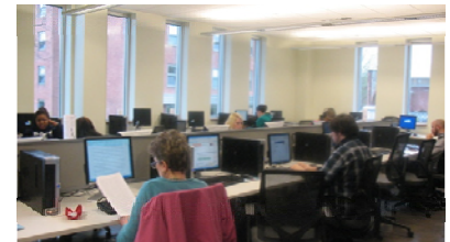
B. Thomas Golisano Library

Each winning library receives a $100 award and will be featured on the RRLC website ( www.rrlc.org ) during National Library Week, April 11 – 17. Winners will also be honored at the RRLC Annual Meeting on June 3 at Casa Larga.