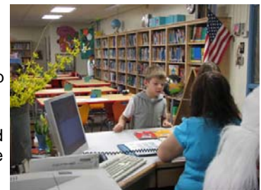
Barclay Elementary School