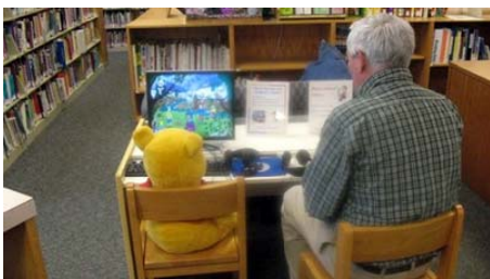
Chili Public Library