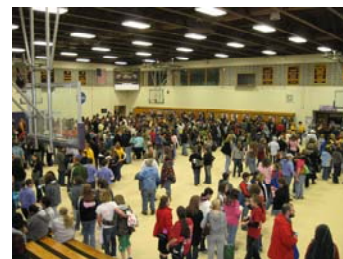
2009 Greater Rochester Teen Book Festival

Nazareth College is graciously hosting the fifth annual TBF on Saturday, May 15 . Bright and early at 9 a.m. (the teens are bright, the time is early). Teen Book Festival staff and volunteers will gather to welcome authors in a limo as they walk down a red carpet. Everyone assembles in the gym for the fun to begin at the opening session!