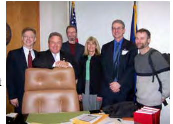
Rochester area library supporters visit the Albany office of NYS Assemblyman Bill Reilich on NYLA Lobby Day

More than 1,000 library advocates -- more than 50 from the RRLC region -- attended NYLA Lobby Day in Albany on March 10, sending a clear message to the Governor and Legislators that our communities care about their libraries. Many of you sent faxes through the NYLA Advocacy Center ( www.nyla.org ).